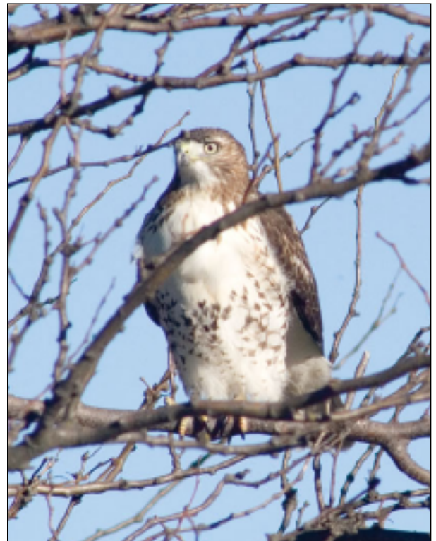
One purpose of SWG and the comprehensive wildlife conservation plan is to keep species from being listed on the federal Threatened and Endangered Species list.

The plan also ranks habitats so that an ecosystem approach would make sense for potential projects. In a logical approach, prioritized habitats and highest ranked species receive first attention. Many of the projects deal with "indicator" species, meaning they are indicators of