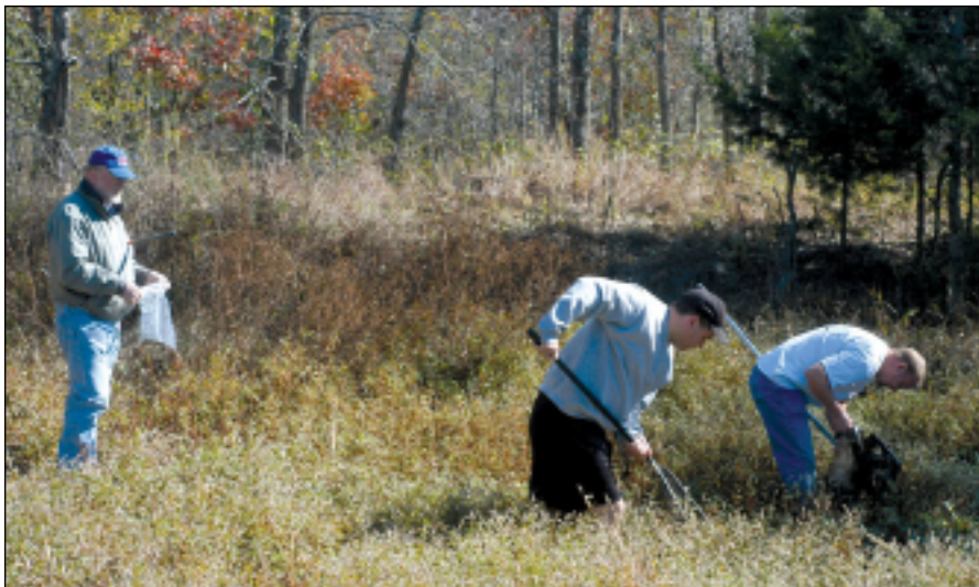
Scientists search an area for reptiles and amphibians while compiling the data for the Kansas Herpetological Atlas .

The biggest threat to many Species of Greatest Conservation Need may be exotic species. SWG supported the development of strategies to deal with this pressing threat.