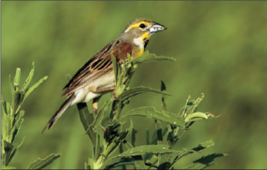
Species of Greatest Conservation Need were identified and many are considered indicator species, meaning their status signals the condition of our environment.

sport fish and wildlife habitat programs benefited nongame wildlife, the SWG habitat programs will also benefit game species. Current funding for SWG in Kansas is almost $1 million per year, but original plans and expectations are for a major annual contribution of $6-$7 million per year for Kansas. At this level, the program would create the substantial third leg of fish and wildlife funding support, equaling the amounts contributed through the sport fish and wildlife restoration programs for sport fish and game animals.