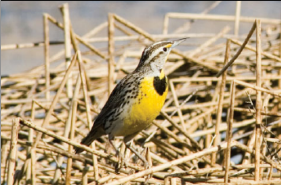
Some of the grassland bird species have shown declines in recent years. One SWG study looked at the effects grazing and burning had on these species.