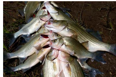
Stringer of White Bass and Wipers