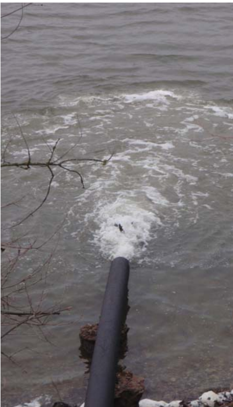
Rainbow trout stocking at Willow Lake

Other local spots for rainbow trout are Moon Lake and Cameron Springs, located on Fort Riley Military Base.