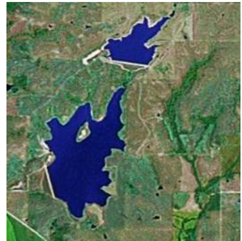
Jeffrey Energy Center Lakes

Smallmouth bass were stocked into Auxiliary Lake in 2003. They have been sampled at low numbers since 2006. But in 2009 an explosion in the population was documented during the spring electro fishing. The previous sample high was 6 fish compared to 74 fish in 2009. Smallmouth should continue to expand and establish themselves into the fishery.