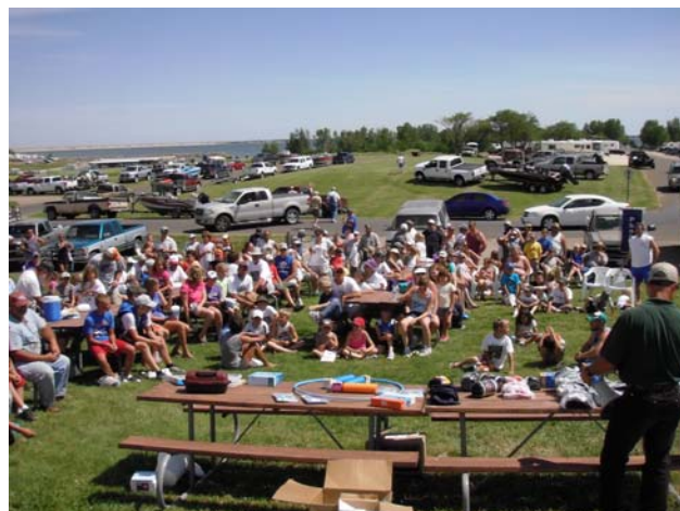
2010 youth tournament participants anxiously waiting the awarding of prizes.