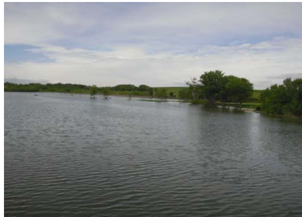
Views of Jewell State Fishing Lake from the boat ramp area when the lake was full in 2010.