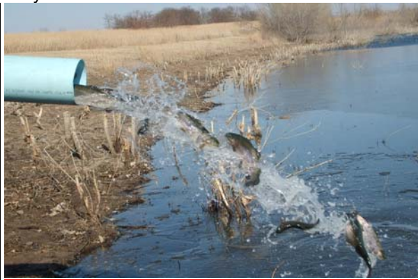
Rainbow trout being stocked in the Glen Elder Park Pond

As always, special regulations apply while fishing trout waters between October 15 and April 15. All anglers are required to purchase a trout permit ($12.15) if they intend to fish the park pond, whether they are fishing for trout or not. Anglers 15 and younger are exempt. In addition, all residents 16 through 64 years old and non-residents 16 and older must also have a valid fishing license. Trout permits are available at KDWP offices, license vendors, county clerk offices, or online at www.kdwp.state.ks.us . The daily creel limit is 5 trout (2 trout for anglers 15 and younger fishing without a trout permit). The possession limit is three times the daily creel.