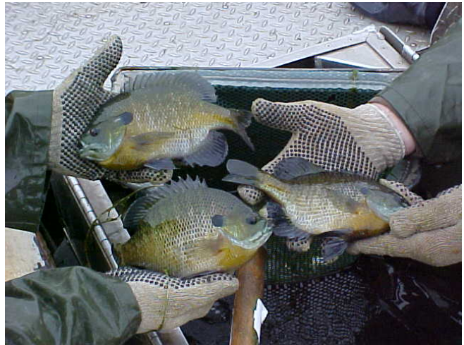
Colorful male bluegill will soon be building nests in shallow water where they can be easily located.

Blue/Redear – Bluegill and redear are common in most all of our lakes. Put a worm on a small hook a few feet below a bobber, and fish along weed lines, and you will probably be successful. Bluegill and redear are members of the family Centrarchidae, or nest builders. They move into shallow water where the male builds a plate-size nest he tends until the eggs hatch. The clearer the water, the deeper they nest. In strip-mined lakes, where shallow water is often restricted to the ends of larger lakes, spawning fish are not hard to find. Spawning areas are at a premium, and all the sunfish are forced to use the few suitable areas. The result is that hybridization is common, and you will often see hybrids of bluegill, redear, green sunfish, longear sunfish, and others. 2010 nettings showed Neosho State Fishing Lake and Bone Creek Lake have the best sunfish fishing. The MLWA is also offers great opportunities.