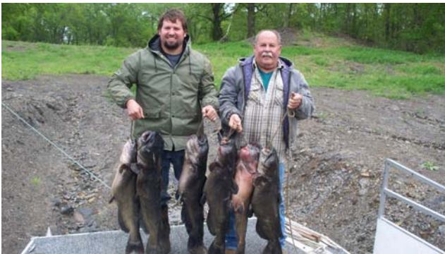
These trophy channel catfish were caught in a private strip pit in Crawford County on April 27, 2011. They ranged in size from 19 to 23 pounds. Live green sunfish were used as bait.

Channel Catfish – Channel catfish anglers are fortunate. Even though channel catfish don't reproduce and maintain their numbers in small lakes on their own, KDWP hatcheries produce plenty. In 2010 over 33,500 intermediates (8-12 inches) were stocked in the Pittsburg district. Catfish are plentiful in all our public waters. Neosho State Fishing Lake, Crawford State Fishing Lake, and Bone Creek Lake ranked the highest based on samplings last October. The MLWA also has a lot to offer, as each fall 14,000 fish are stocked throughout hundreds of pits. As seen in the photo below, and the fact that the state record 36-pound channel cat was caught in the MLWA, strip-mined lakes are capable of producing big fish. If you like river fishing and the opportunity to set limb-lines or trot-lines, the Neosho River and Spring River-Empire Lake complex offer some good fishing. Another good bet, and ranking excellent in the Fishing Forecast, is nearby Bourbon County Lake at Hiattville.