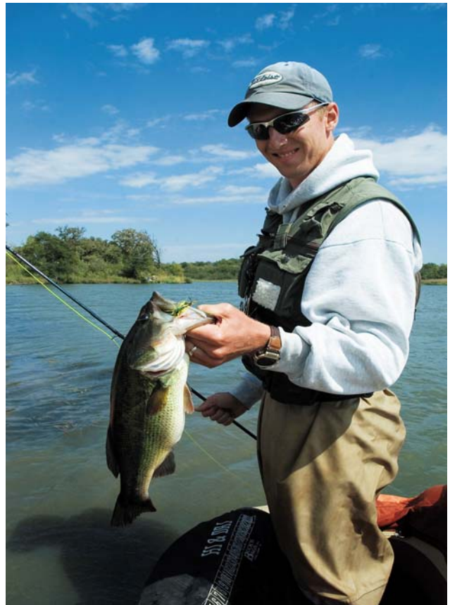
Largemouth bass are common in all our public lakes, and occasionally, trophies like this are landed.

Largemouth Bass - Bass are also now moving into shallower water to spawn. The best bass lakes in the Pittsburg district are Bone Creek and the Mined Land Wildlife Area (MLWA). Electrofishing in 2010 at Bone Creek showed 85 percent of the catch were 12-inches or larger, with 44 percent over 15-inches. In 28 Thursday Jackpot Bass Club events in 2010, there were 224 bass over 18-inches caught. The quality of the bass fishery is very good. All MLWA lakes have bass, but the best for big fish are often the ones that don't receive heavy fishing pressure. It could be worth the extra effort to walk into or portage into an overlooked or hard to get to lake. Chanute City Lake sampling showed good quality, but low to moderate density. Thirty-five percent of Chanute's sample was over 15 inches, and five percent were over 18 inches. Other nearby lakes with good bass ratings includes Bourbon County Lake and Big Hill Reservoir.