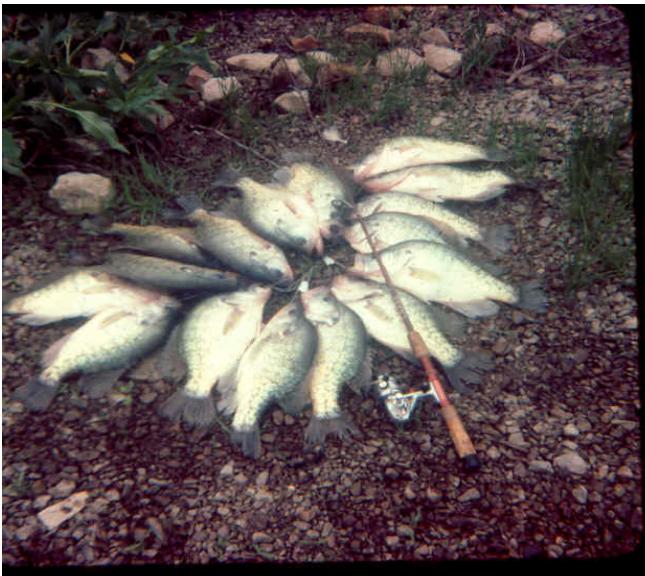
Stringers of crappie like this are possible in some of our local waters.

Crappie – The water temperature is already in the low to mid-60s, and crappie are moving in shallow to spawn. It's time to get after it. The highest density population of 8-inch and larger crappie was found at Neosho State Fishing Lake. The October frame-net catch was 70 fish/net. Although numbers are high, you'll have to sort through a lot of smaller fish for a good mess to eat. Only 6 percent of the catch was over 10 inches. Crawford State Fishing Lake and Chanute City Lake also have high numbers of smaller fish, with some larger fish mixed in. Bone Creek and some of the larger lakes on the Mined Land Wildlife Area have more quality-size fish to offer. Bone Creek frame-net catch rates are low due to the very clear water, but last year anglers commonly reported catching crappie 12 inches and larger. Nearby Bourbon County Lake (Hiattville) and Big Hill Reservoir have good crappie populations too, and would be good places to wet a line and have a good chance for some larger fish.