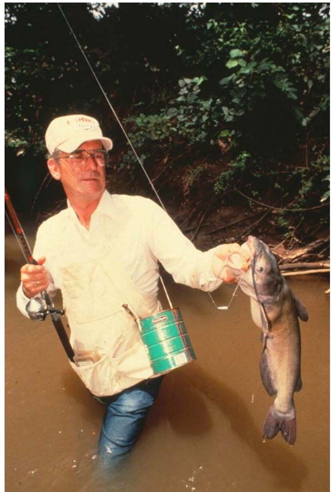
Large catchable-size channel catfish will be stocked in public lakes in the Spring River drainage when funds are received from the Orval Kent settlement.

Orval Kent Food Company, Inc., headquartered in Wheeling, Ill., must also spend at least $32,500 on a project to re-stock fish in or near the watershed of the Spring River.