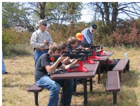
Air rifle station at annual outdoor youth event.

Anyone, age 11 through 16 may participate. Participants are required to pre-register for the event. Students are not required to have completed a hunter education course, but prior completion is preferred. The event will begin at 12:00 p.m. at the COE managed area between Marina Cove and Neosho Park, approximately 0.25 miles west of the COE office at the west end of the dam. Check-in and a free lunch provided by QUWF, will be between 12:00 p.m. and 12:30 p.m. Instruction will then begin at 12:30 p.m. and will end at approximately 4:00 p.m.