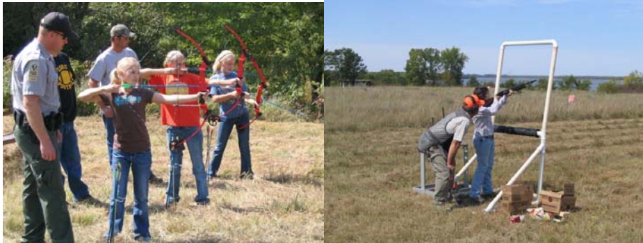
Archery station at annual outdoor youth event. Shotgun station at annual outdoor youth event.

Area youth are invited to attend a FREE shotgun, pellet rifle, and archery shooting and safety clinic on Saturday, September 22 at Council Grove Lake (just 1 hour drive north of El Dorado Lake). Sponsored by the Kansas Department of Wildlife, Parks, & Tourism (KDWP), The U.S. Army Corps of Engineers (COE), the Flint Hills Chapter of Quail and Upland Wildlife Federation (QUWF), and Morris County Hunter Education instructors, this special event will provide participants with an opportunity to enhance firearm and archery shooting and safety skills. Controlled live fire instruction will teach safe, responsible, and fun shooting techniques.