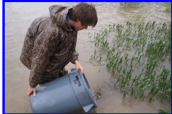
A volunteer stocking fingerling bass into American water willow.