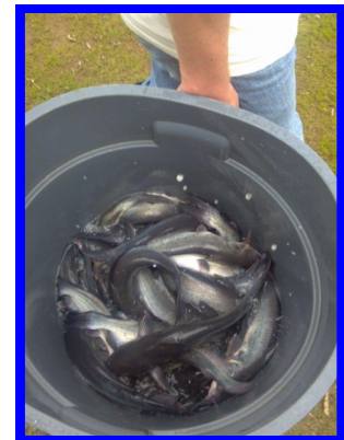
A bucket of channel catfish stocked via the Urban Fishing Program.