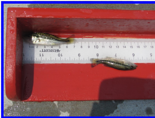
Fingerling largemouth bass stocked in 2013.