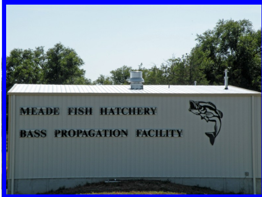
Meade Fish Hatchery Bass Building.