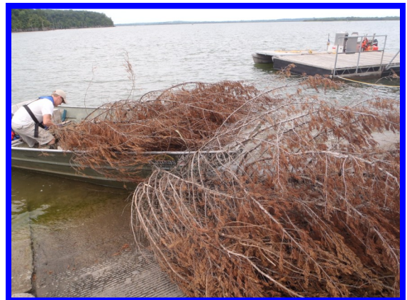
NEW brushpiles installed near Marysville area of Hillsdale Reservoir: Here are the GPS locations (Datum NAD83):

N38.67901 W094.89870, N38.67630 W094.89902, N38.67630 W095.90158, N38.67360 W094.90623, N38.67268 W094.90611