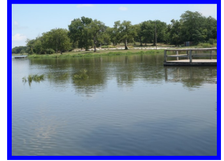
New brushpile located on south side of Olathe—Cedar Lake.