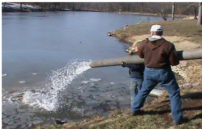
Trout stocking at Ft. Scott's Gunn Park. During the trout season 400 trout are stocked every two weeks. This 2-acre pond has excellent shoreline angling access.

While some anglers are sitting in the house waiting for warm weather, others are taking advantage of the trout fishing at Gunn Park in Ft. Scott. This winter's trout fishery is the result of the KDWPT's Winter Fishing Opportunity (W.F.O.) program with the City of Ft. Scott. Trout are stocked every two weeks from the start of the season Nov. 1 through April 15. Overall, trout fishing has been good this year, and the trout pond was frozen over only a few times this winter. The City operates an air cannon that mixes water from the bottom to the top, which decreases the likelihood of the pond freezing over, thereby allowing more days of fishing action. Older anglers or families with younger children have easy access to this pond as the area provides excellent shoreline fishing. After April 15, the water temperatures can reach the upper limits for trout survival, so stockings are stopped. The required yearly trout permit costs $12.50. Anglers 15 years of age and younger may trout fish without a trout permit if they adhere to a two-fish-per-day limit.