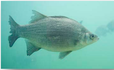
White Bass ( Morone chrysops )