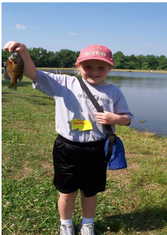
Bluegill are found in every public fishing water in southeast Kansas. They are the bread-and-butter for kids, and are hard to beat in the skillet.

Bluegill/Redear – Bluegill and redear sunfish are common in most all of our lakes. Put a worm on a small hook a few feet below a bobber, fish the rig along weed lines, and you will probably be successful. Bluegill, redear, bass, and crappie are members of the family Centrarchidae, or nest builders. They move into shallow water where the male builds a plate-size nest and tends it until the eggs hatch. The clearer the water, the deeper they nest. In strip mined lakes, where shallow water is often restricted to the ends of larger lakes, spawning fish are not hard to find. Spawning areas are at a premium, and all the sunfish are forced to use the few suitable areas. The result is that hybridization is common, and you will often see hybrids of bluegill, redear, green sunfish, and longear sunfish. 2013 nettings showed Neosho State Lake and Bone Creek Lake have the best quality sunfish fishing. The MLWA is also offers great opportunities.