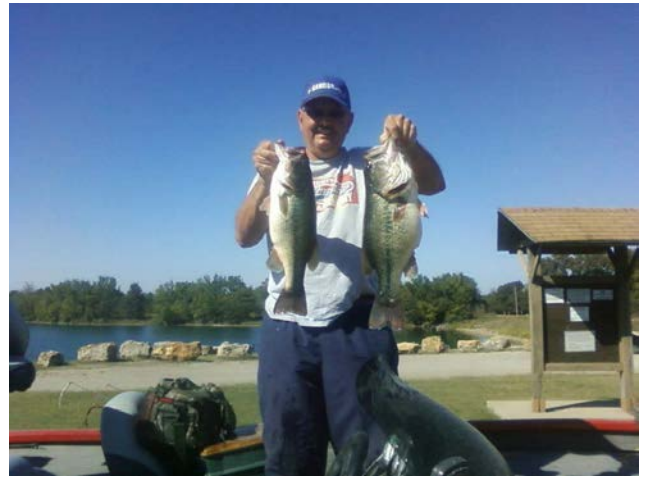
The Mined Land Wildlife Area produces some big largemouth bass like these two beauties caught in the trout lake. These fish were no doubt enjoying a supplemental diet of rainbow trout.

Largemouth Bass - When water temperatures reach about 63 degrees, bass will move into shallower water to spawn. The best bass lakes in the Pittsburg district are Bone Creek Lake, the Mined Land Wildlife Area (MLWA), Chanute City Lake, and Neosho State Lake. Electrofishing in 2013 showed Bone Creek had the highest quality fishery as 37 percent of the catch were 15-inches or larger. The catch rate for 8-inch and larger bass at Bone Creek was 96 fish per hour, the highest catch ever recorded. All MLWA lakes have bass, but the best for big fish are often the ones that don't receive heavy fishing pressure. It could be worth the extra effort to walk into or portage into an overlooked or hard to get to lake. The Chanute City Lake sampling showed both good quality and high density. The electrofishing catch rate was 121 fish per hour with 22 percent of the catch over 15-inches in length. Neosho State Lake had a catch rate of 117 fish per hour with 14 percent over 15-inches. Other nearby lakes with good bass ratings are Big Hill Reservoir and Wilson State Lake.