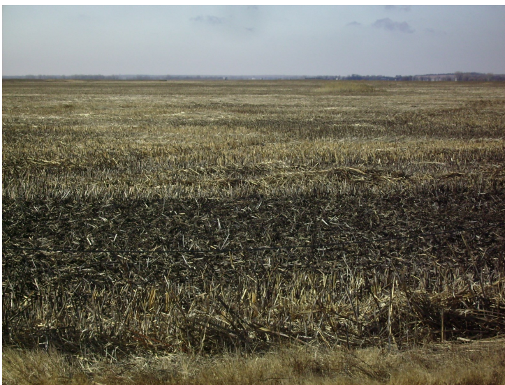
Cattail mowed during winter 2015-16 in Pool 3B.