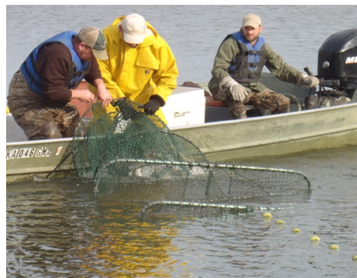
Sampling walleye at Hillsdale Reservoir.

Fish populations are dynamic, internal and external environmental forces can cause changes in population characteristics (e.g., survival, recruitment, harvest, emigration, etc.). Annually, each fall, we use nets to sample and evaluate fish populations. We evaluate relative abundance, population size structure, and fish condition. Performance of regulations is always a consideration during this evaluation. During spring walleye egg collection efforts I also evaluate adult walleye size structure and sex ratio (male to female). Kansas walleye populations in general are characterized by fast individual growth, limited recruitment, and high harvest rates.