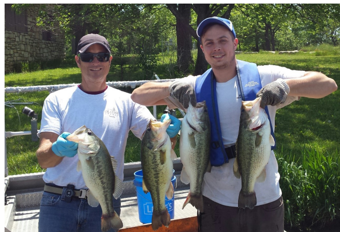
Prime examples of Olathe-Cedar Lake largemouth bass.