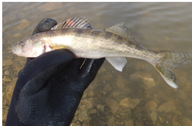
Next generation of a Hillsdale Lunker.

Currently the Hillsdale walleye population is dominated by 13-17 inch fish. Anglers have had a lot of success catching this size of fish in 2017, with not a lot of success catching harvestable size fish (> 18 inches). I suspect this is because of very large year classes of fish from 2014 and 2015. This is not necessarily a bad thing, it just means a very large proportion of the population is made up of these year classes and size range. There are still many > 18 inch walleye to be caught, but due to sheer numbers of 2014 and 2015 fish, they are proportionally a minority. Hopefully these strong year classes hold on through time, thus translating to higher abundance of large walleye in the future. This fall I plan to age some of the walleye sampled to further evaluate year class strength and growth. Look for updates in the future.