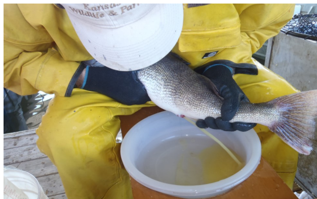
Eggs being collected from female walleye.

Hillsdale Reservoir is currently 1 of 2 waterbodies in the state of Kansas which is used as a broodstock waterbody for walleye (the other being Cedar Bluff Reservoir; walleye eggs are also collected at El Dorado Reservoir for saugeye production). Hillsdale and Cedar Bluff Reservoirs provide enough walleye eggs to produce walleye fry and fingerlings to stock in waters statewide! The current walleye regulations at Hillsdale Reservoir are primarily aimed at protecting the broodstock fish. The current walleye regulation at Hillsdale Reservoir is an 18 inch minimum length limit with a 5 fish daily creel limit. By and large, we feel the regulations are achieving the goal of broodstock protection.