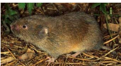
Southern Bog Lemming