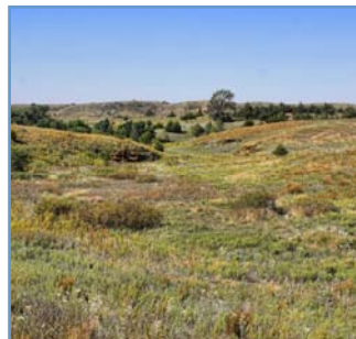
Mixed Grass Prairie

Kansas Priority Habitats were prioritized based on their dominance and importance to the conservation of SGCN. Priority habitats that occur in the Cheyenne Bottoms EFA are Mixed Grass Prairie, Sand Prairie, Herbaceous Wetlands, and Seeps and Springs.