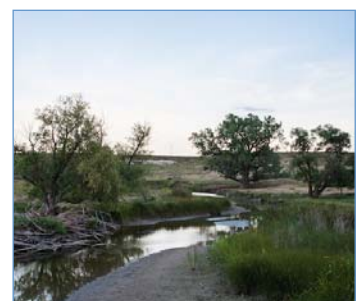
Riparian Corridor Complex