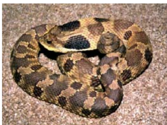
Eastern Hog-nosed Snake