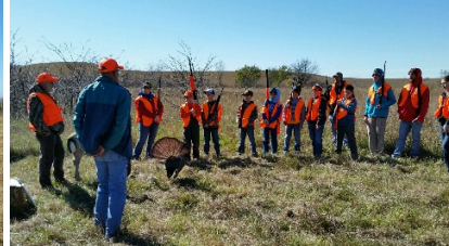
Hunting Safety Skills Station