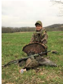
Successful youth spring turkey hunter.

Turkey: The fall hunting outlook for turkey on the area is fair. Although still locally common, turkey numbers have declined recently on the wildlife area as a result of diminished production following significant flooding in 2015 and “modest at best” production in 2016 and 2017. Although habitats were degraded and some nesting was likely avoided in lower elevation habitats adjacent to the lake again this spring, overall habitat conditions are improved again this year as compared to two years ago. Turkey broods have still been observed in recent years, but observations appear to be less frequent and extensive. Timely precipitation that occurred much of this summer has produced robust conditions in area cropland and native grass habitats, and has continued to improve understory vegetation in many woodland habitats impacted from the 2015 flood. Those improved conditions will help to provide attractive habitat for wintering turkeys and enhance nesting opportunities for birds next spring. Prior to declines in turkey production beginning in 2015, turkey populations benefited from good production dating back to at least 2012. As such, turkey hunters are likely to find that area flocks contain a greater proportion of experienced adult birds which may make hunting more difficult.