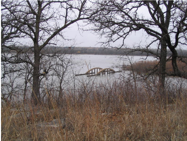
A scenic winter view of Council Grove Lake.

Would you like more information about the Council Grove Wildlife Area?