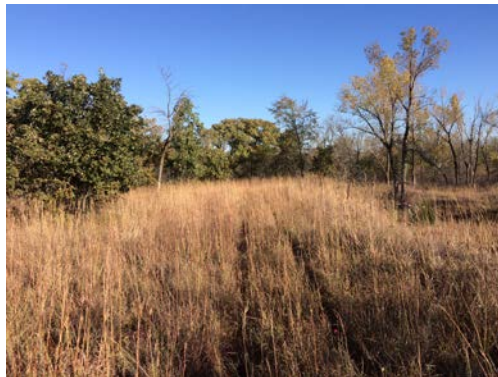
ATV tracks are often evident within area grasslands after KDWPT staff utilize such equipment to treat noxious and invasive plants.

Nearly every fall I'm asked, "why are there ATV tracks through all of the fields?" The answer is a simple one. ATV's have become an essential public land management tool. They are utilized extensively by staff to conduct annual habitat reviews and to implement management actions designed to conserve and enhance area habitats. ATV tracks are often still evident each fall after late summer noxious weed treatment efforts have been completed. Each year, area staff may spend as many as 70–100 hours utilizing an ATV to spot spray noxious weed species such as Johnsongrass and sericea lespedeza, or other invasive plants such as crown vetch or woody vegetation. Habitats are often thoroughly reviewed in a grid like pattern from an ATV to ensure that area habitats receive appropriate treatments to remove such harmful plant species. Ultimately their use improves staff efficiency and effectiveness, allowing us to better manage more acres, enhancing wildlife use, and your outdoor recreation experience.