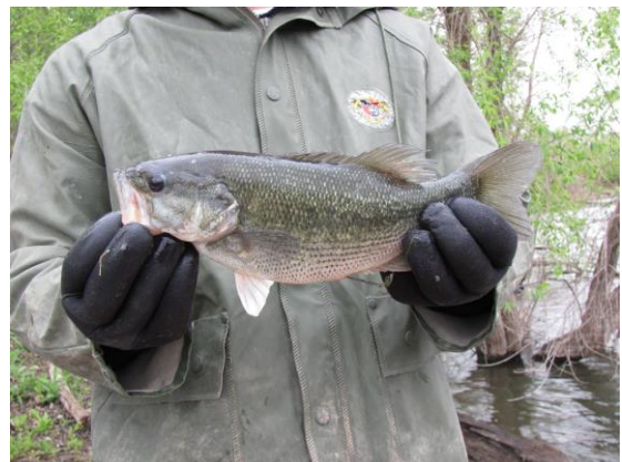
*Sebelius spotted bass

A 15-inch length limit is in effect on all black bass at Sebelius Reservoir.