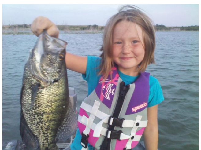
* A satisfied Kirwin angler

KDWPT is delighted to partner with the City of Agra in developing additional fishing waters for the angling public. Even if you are not an angler, you should visit this historic lake for a stroll on the walking trail, or just take a moment for some fresh air and enjoy the hard work that the City has done on this renovation project. It is still a work in progress that will only get better in the future. Enjoy the lake and PLEASE help to keep it CLEAN.