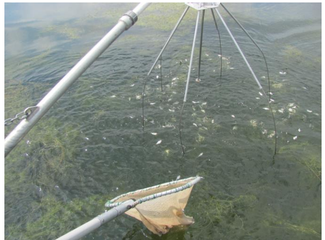
* Young of the year shad sampling.

Young-of-the-year (YOY) shad sampling was completed this past August at Webster, Kirwin and Keith Sebelius Reservoirs. Baby shad are sampled at 10 random sites throughout the water body and then sampled for 360 seconds of EFT (energized field time). When all is said and done one hour of effort is expended at each impoundment. This sample is performed to determine what size the shad are and how many are available for sportfish to utilize. These YOY fish are the ones that help sustain all the other fish and maintain them through the winter. The goal is typically around 250 fish per site with 50 percent of them being under 70 mm. All three reservoir samples exhibited excellent forage production indices in 2019.